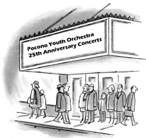
"Were you at last night's performance? I heard they're going to Carnegie Hall next year!

Our costs include Directors' salaries, music purchases, the printing of programs and the partial subsidy of our annual field trip to Carnegie Hall. Student tuition is much lower than that of similar orchestras. Therefore, we